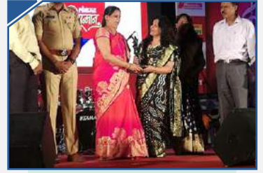
Lokmat Sakhi Manch award Aurangabad