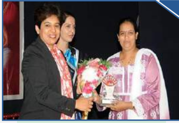
Tejaswini Award Tejaswini Group, Aurangabad