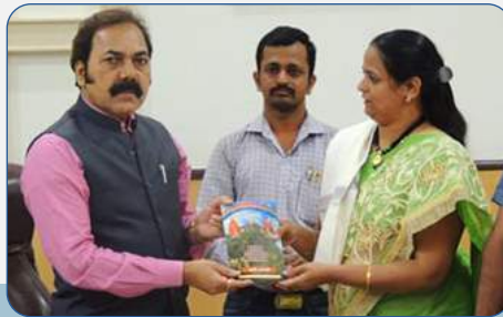
Felicitated by Jai Sahitya Prakashan.