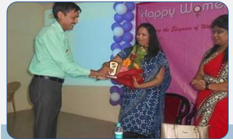
Awarded Director of Aarambh was honored by Matsyodari Engg. College, Jalna