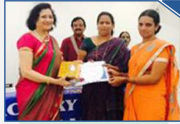
Special school Teacher Award by Rotary Club