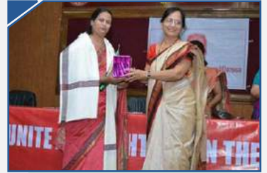
Award by State Bank of India Woman's Wings