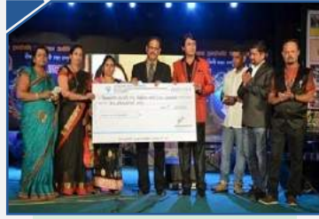
Special award from Sakshama Group, Aurangabad.