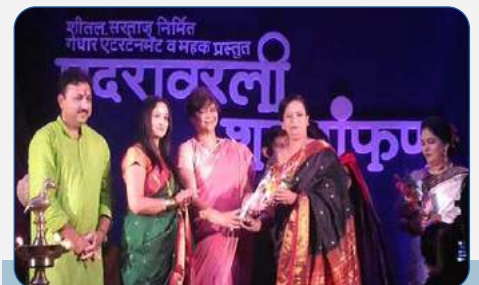
Greetings in the program Padarvali Shabad Gunfan