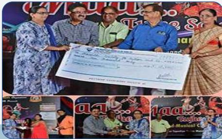
Donation by Swar Sakshama Group, Aurangabad