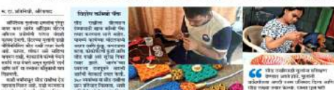
मुलांच्या अभिनवातून नागरिकांचा प्रतिसाद.

आरंभ ऑटिझम सेंटरच्या मुलांचा अभिनव उपक्रम, नागरिकांचाही प्रतिसाद. मुलांच्या अभिनवातून नागरिकांचा प्रतिसाद.