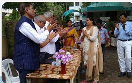
Felicitated by Garware Community Center, Aurangabad