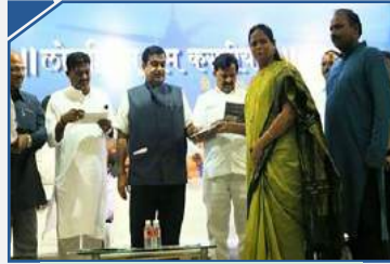
Special Award and donation by Nitin Gadkari Satkar Samiti at Nagpur.