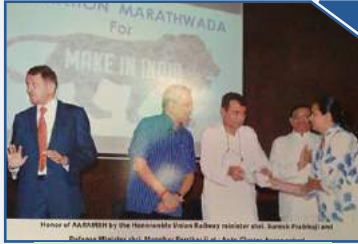
Special Award by Marathwada Auto Cluster